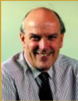
Chairman of English Heritage

I have taken particular interest and pleasure following Liverpool's progress towards world heritage status and am especially pleased that English Heritage has been able to work with the City Council and its other partners in preparing the bid. Throughout I have been deeply impressed by the energy and commitment shown by Liverpool City Council. The encouragement and support of the North West Development Agency and the Cultural Consortium have also been particularly notable. It is a strong endorsement of the growing belief of the leading role that the historic environment can play in social and economic regeneration. I greatly welcome this Management Plan and am delighted, once again, to offer my wholehearted support to Liverpool's bid for World Heritage Status.