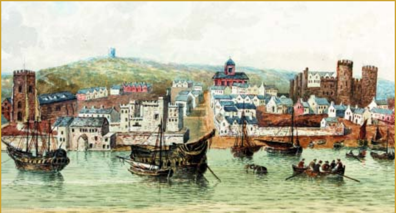
"Conjectural view of Liverpool 1680"

Celia Fiennes-The Journeys of Celia Fiennes 1698