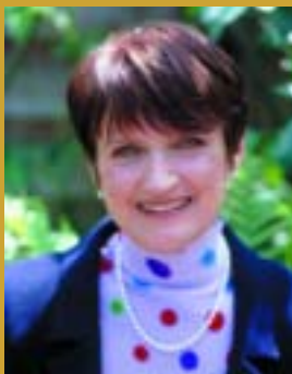
The Rt Hon Tessa Jowell MP Secretary of State for Culture, Media and Sport

I am extremely grateful to the many bodies and individuals who have worked so hard to produce this Plan, in particular the constituent members of the Liverpool Steering Group. I feel sure that this document will prove to be an invaluable management tool to all those involved in the ongoing conservation and presentation of this very special place.